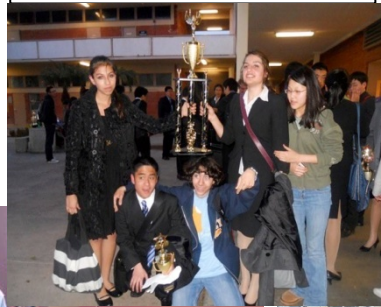
Congratulations to us after the State Qualifier Tournament for our Sweepstakes award, among many others. 15 of us qualified and went to the California State Tournament last year. We took home two 2 nd place trophies, a 4 th and a 5 th , a great accomplishment for our small school.