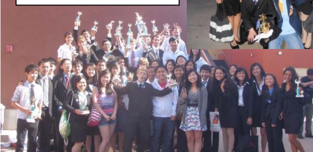
Our extremely successful novice team displaying their awards at the Novice Championship Tournament which was dominated by San Marino High School!